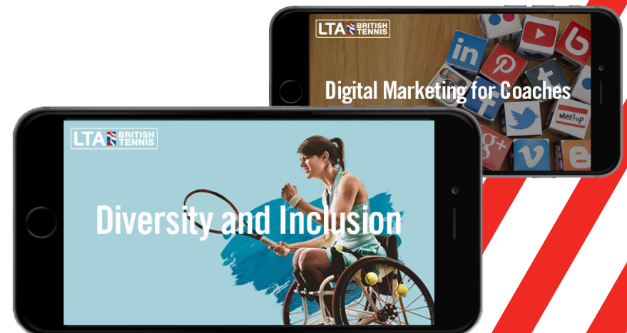
Recently published online courses from the LTA

The LTA recognises that there are many different schools of thought when it comes to player and coach development. We therefore work with a number of external experts and coach education providers to offer a broader spectrum of professional development opportunities. It is up to the coach to decide which courses are best suited to them and to make an informed decision as to which CPD will develop their career. We work with external providers to ensure that the CPD they offer meets the required standards.