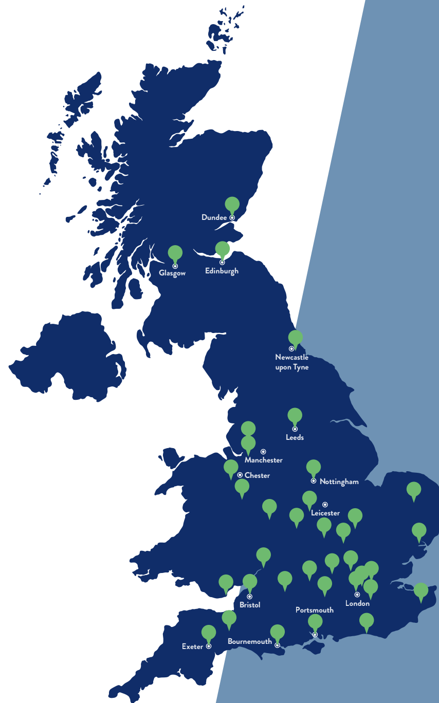
Map depicting the geographical spread of LTA Coach Forums

As with any profession, it is important to stay up-to-date and develop your knowledge and skill sets throughout your career. Continuous professional development will keep you motivated, connect you with like-minded professionals and allow you to be the best coach that you can be. Accredited+ coaches are amongst the most committed coaches globally when it comes to professional development. Their 15 hour annual commitment compares favourably against most other nations - one of the reasons the LTA coach development system is one of only 18 countries recognised by the ITF at the highest level (gold status).