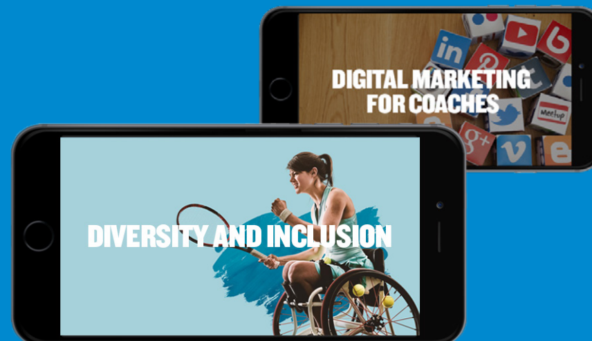
Recently published online courses from the LTA

The LTA recognises that there are many different schools of thought when it comes to player and coach development. We therefore work with a number of external experts and coach education providers to offer a broader spectrum of professional development opportunities. It is up to the coach to decide which courses are best suited to them and to make an informed decision as to which CPD will develop their career. We work with external providers to ensure that the CPD they offer meets the required standards.