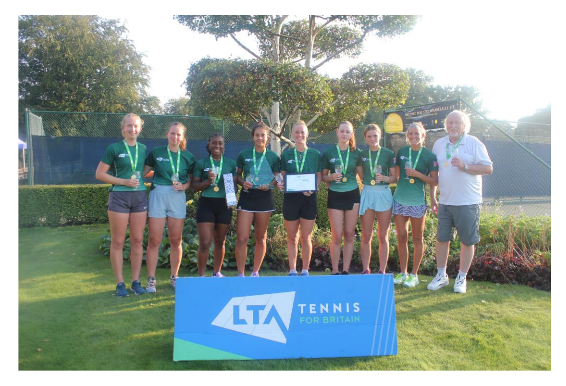
Sutton Tennis & Squash Club (Surrey) – National Open Women's Winners 2023

2023 - Sutton Tennis & Squash Club beat Roehampton Club