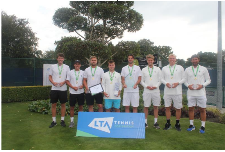
Roehampton Club (Surrey) – National Open Men's Winners 2023

2023 - Roehampton Club beat Sutton Tennis & Squash Club