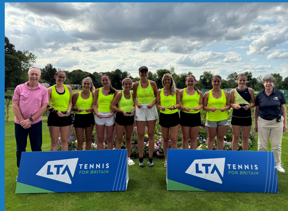
Above: Cheshire Women Left: Somerset Women