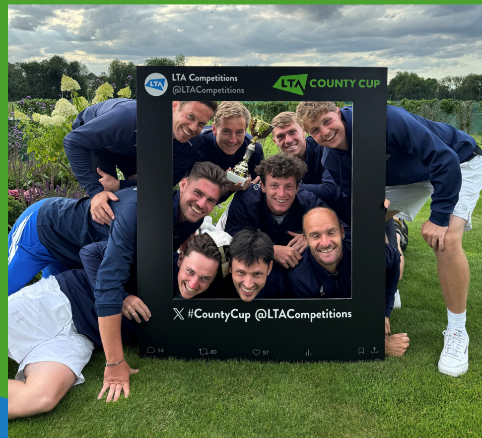
Left: Warwickshire Men Above: South Wales Men