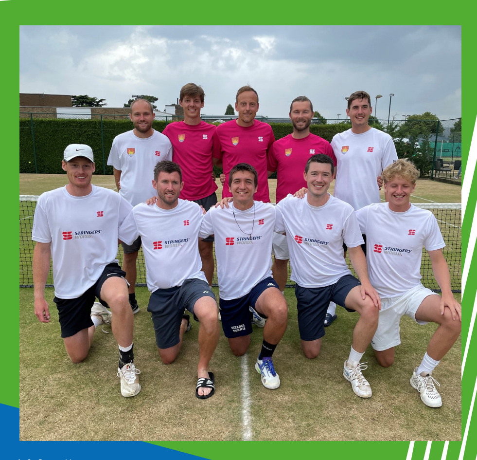
Left: Surrey Men Above: Suffolk Men