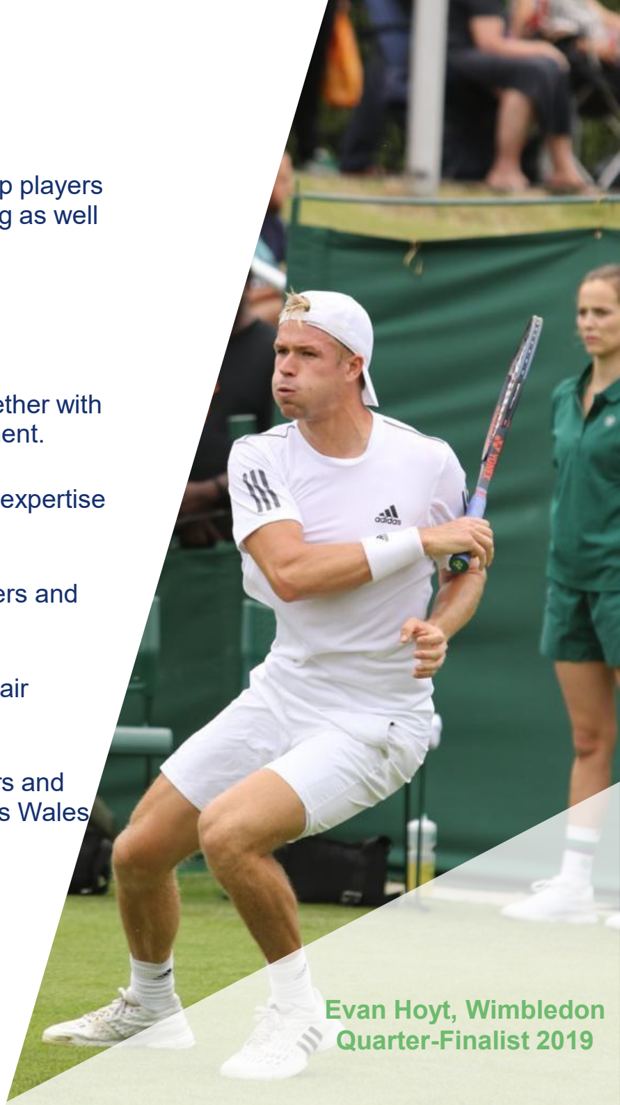
Evan Hoyt, Wimbledon Quarter-Finalist 2019