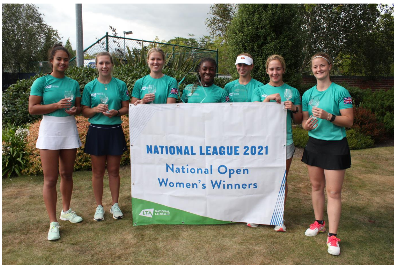
Halton Tennis Centre (Buckinghamshire) – National Open Women's Winners 2021

2021 – Halton Tennis Centre beat David Lloyd Sunderland