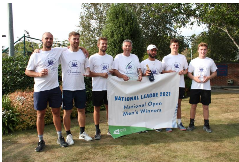
Sutton Tennis & Squash Club (Surrey) – National Open Men's Winners 2021

2021 – Sutton Tennis & Squash Club beat David Lloyd Raynes Park