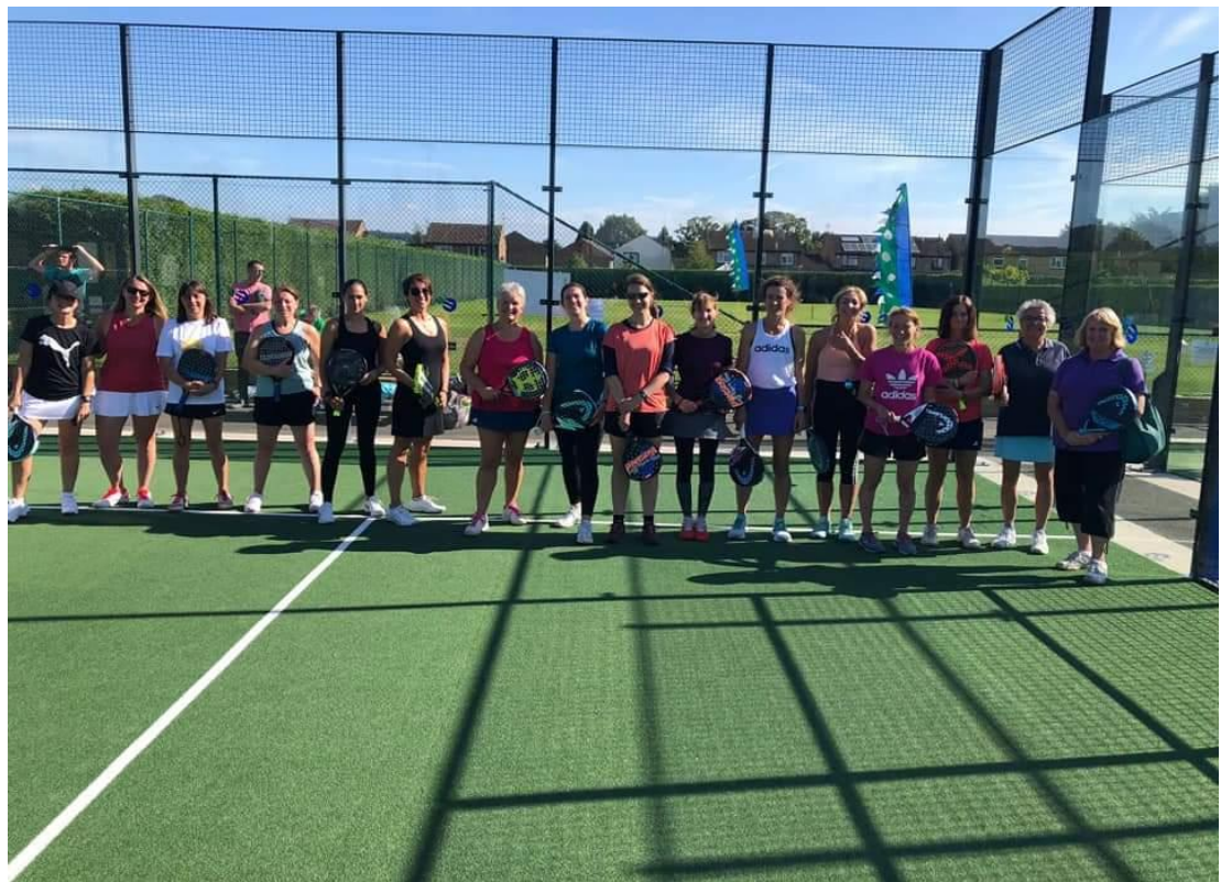
East Glos padel ladies