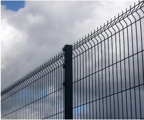
Rigid panel weld mesh fencing