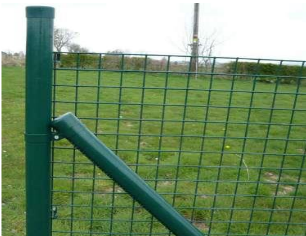
Roll Weld Mesh Fencing on Tubular Posts.

This fencing should comprise 2.75m high x 50mm x 3.25/2.50mm gauge, galvanised core, green plastic coated chainmesh suitably threaded or clipped with rust resistant clips to green plastic coated line wires (galvanised core) to the external perimeter of the court. The fencing is connected to either angular or tubular posts, with tubular posts now being the most common because they are stronger and more likely to be able to install windbreaks if top and bottom tubular supports are used. Chain-link fencing is considered to be the cheaper option with costs starting at £110 per metre run with tubular posts.