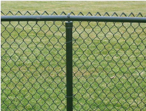
Chainlink fencing on tubular posts.

There are three main types of fencing available to install around the perimeter court block. These being chain link, roll weald mesh and rigid panel. When choosing which type of fencing to install, venues should consider cost, security/openness of the court block, windbreak use and surrounding landscape.