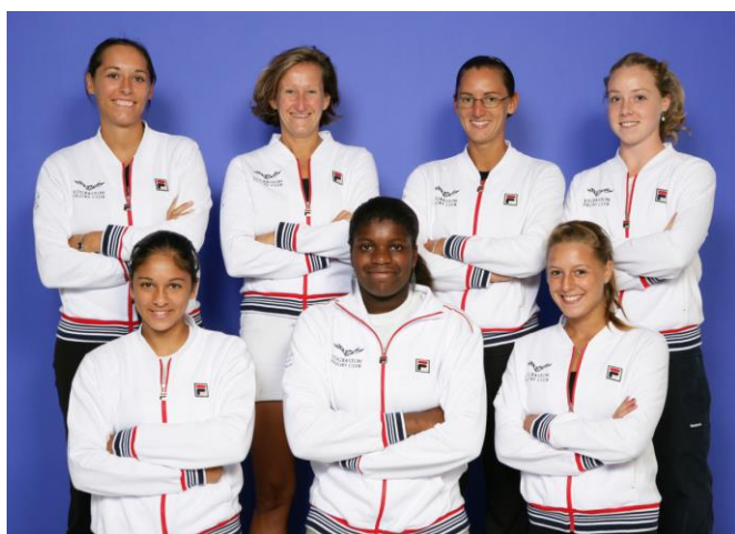
Edgbaston Priory Club (Runners-Up 2008)

2008 – Holcombe Brook Sports Club beat. The Edgbaston Priory Club