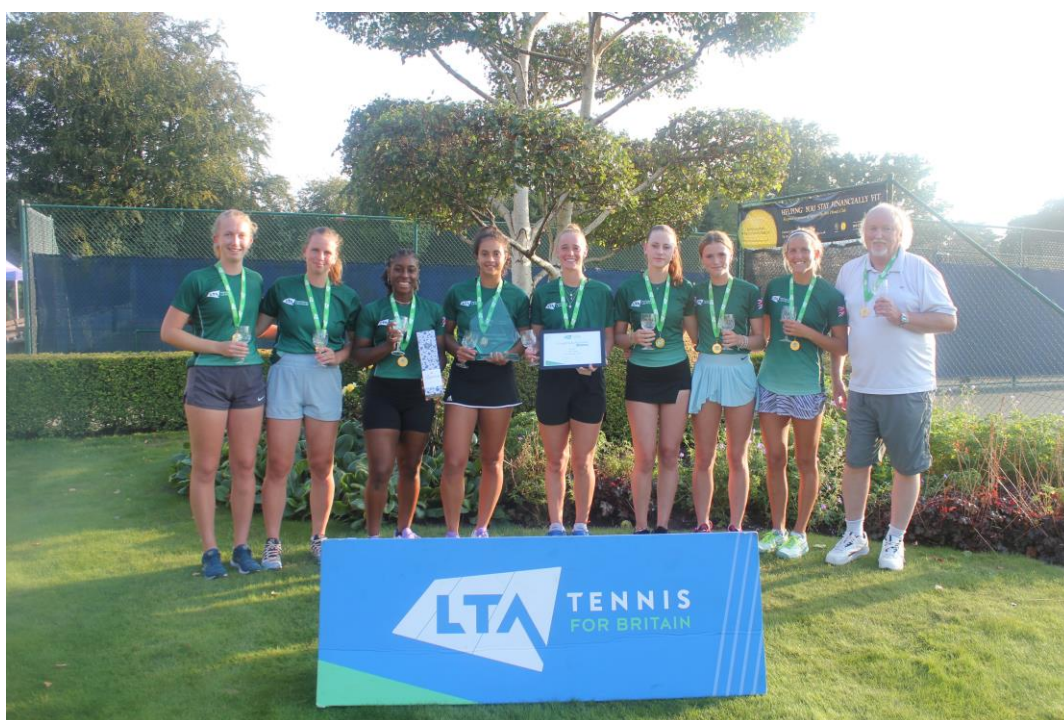
Sutton Tennis & Squash Club (Surrey) – National Open Women's Winners 2023

2023 – Sutton Tennis & Squash Club beat Roehampton Club