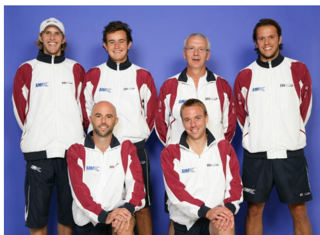
Bromley LTC Men (Runners Up 2008)