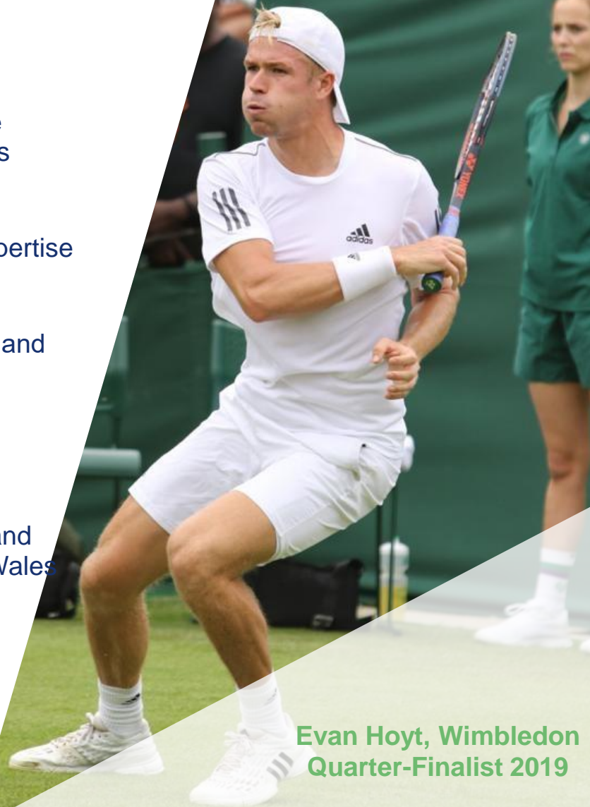
Evan Hoyt, Wimbledon Quarter-Finalist 2019